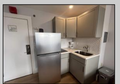
807 8th Ocean City, NJ 08226