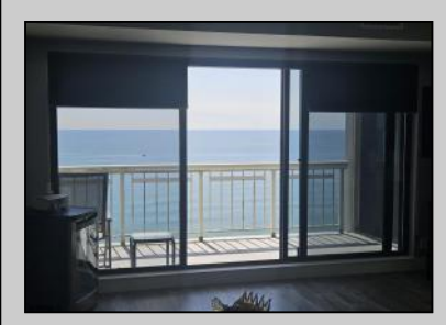
3101 Boardwalk Atlantic City, NJ 08401