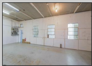
2431 Fairmount Ave Atlantic City, NJ 08401