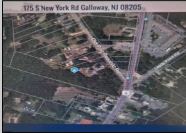
175 S New York Rd Galloway, NJ 08205