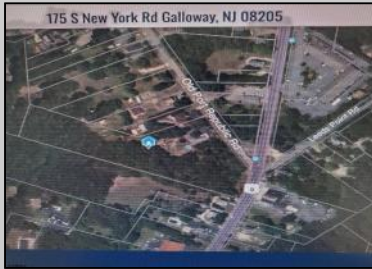
175 S New York Rd Galloway, NJ 08205