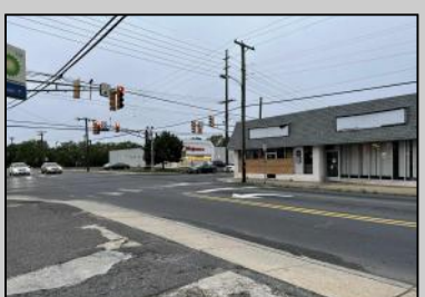
901-911 Main Pleasantville, NJ 08232