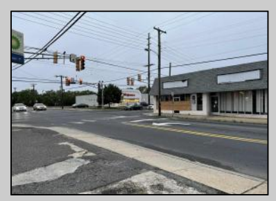
901-911 Main Pleasantville, NJ 08232