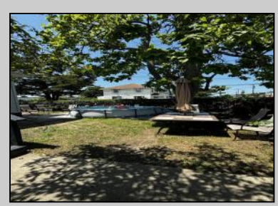
15 Adams Ave Pleasantville, NJ 08232