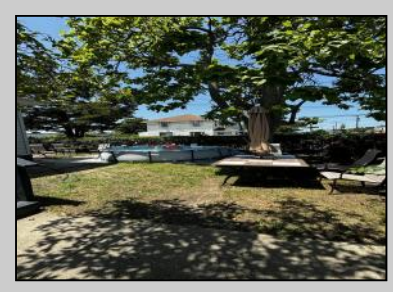
15 Adams Ave Pleasantville, NJ 08232