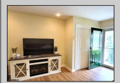
55 Chapman Somers Point, NJ 08224