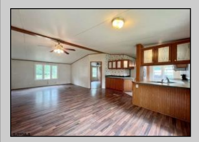
105 Hollywood Dr Egg Harbor Township, NJ 08234