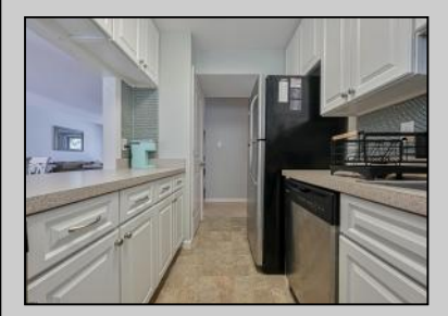
138 Flinders Reef Ocean City, NJ 08226