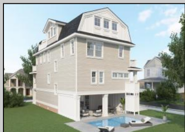
21 Kenyon Margate, NJ 08402