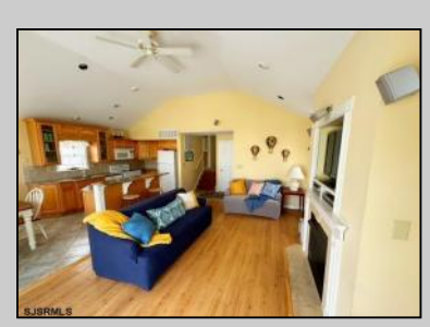
3245 Asbury Ocean City, NJ 08226