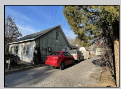
731 White Horse Galloway Township, NJ 08205