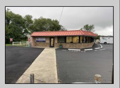
977 12th Hammonton, NJ 08037