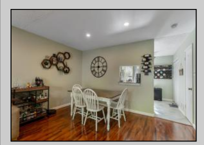
288 Mattix Run Galloway Township, NJ 08205