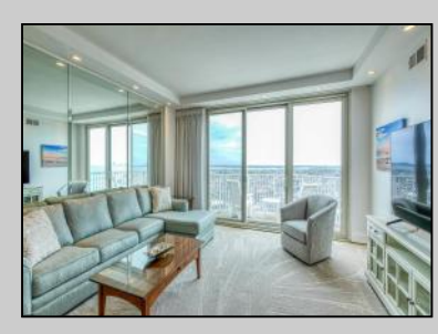
322 Boardwalk Ocean City, NJ 08226