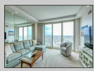
322 Boardwalk Ocean City, NJ 08226