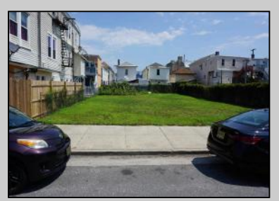
19-21 Texas Atlantic City, NJ 08401