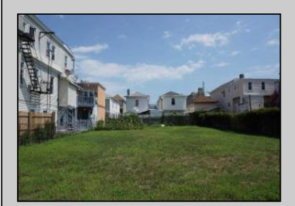
19-21 Texas Atlantic City, NJ 08401