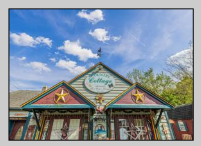
4501 White Horse Pike Hammonton, NJ 08037