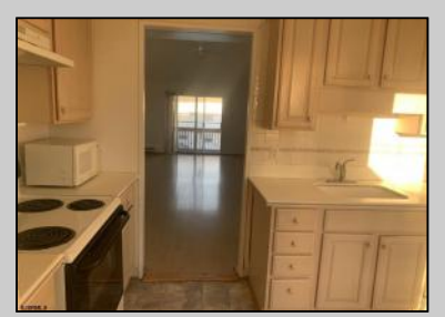
269 39 Brigantine, NJ 08203