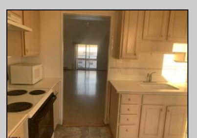
269 39 Brigantine, NJ 08203