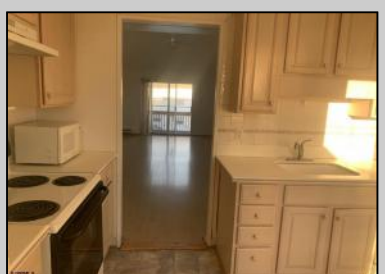
269 39 Brigantine, NJ 08203