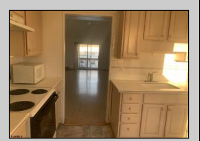
269 39 Brigantine, NJ 08203