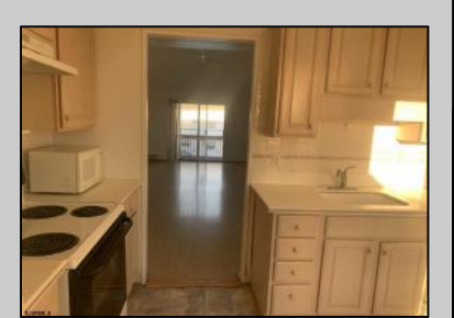
269 39 Brigantine, NJ 08203