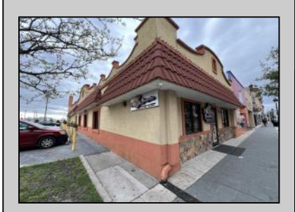
30 Main St Pleasantville, NJ 08232