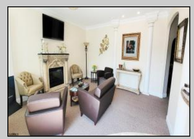
1318 Main Road Vineland, NJ 08360