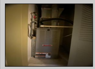
76 Meadowridge Smithville, NJ 08205