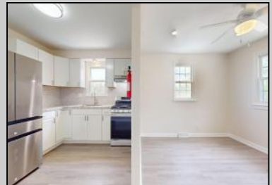
406 Larchmont Pleasantville, NJ 08203