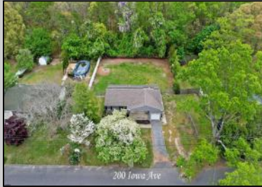
200 Iowa Ave