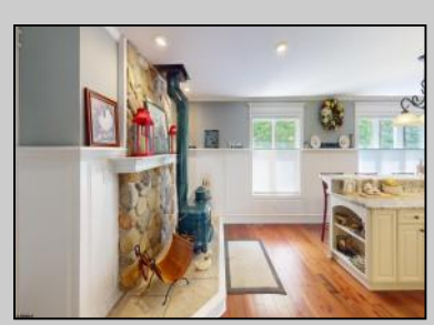
228 Marlin Rd Absecon, NJ 08201