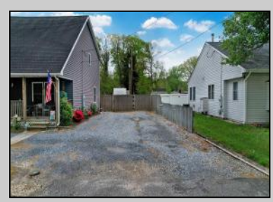
178 Steelmanville Egg Harbor Township, NJ 08234