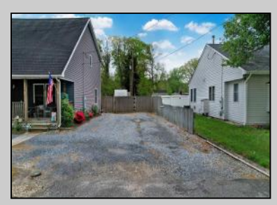
178 Steelmanville Egg Harbor Township, NJ 08234