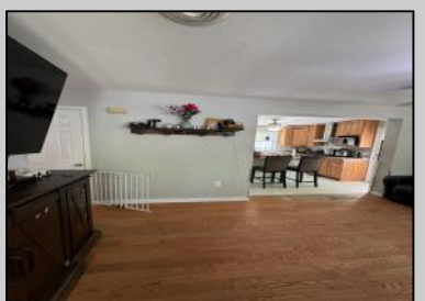
206 Alder Egg Harbor Township, NJ 08234