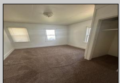
216-218 London Egg Harbor City, NJ 08215