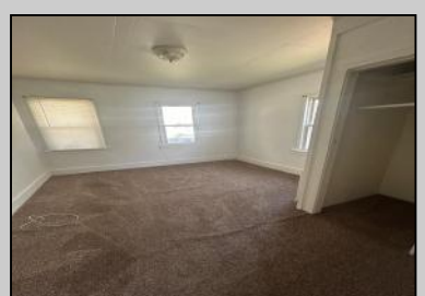
216-218 London Egg Harbor City, NJ 08215