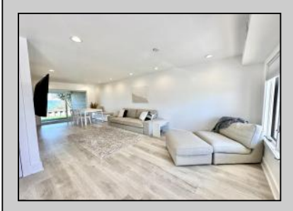
4325 Atlantic Brigantine Blvd # A Brigantine, NJ 08203