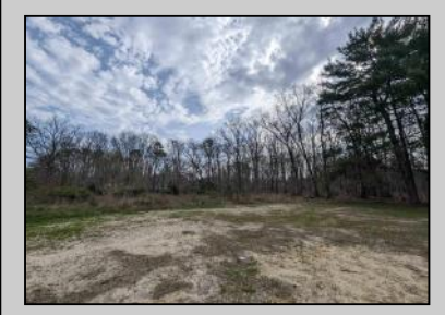
5064 Tremont Ave Egg Harbor Township, NJ 08234