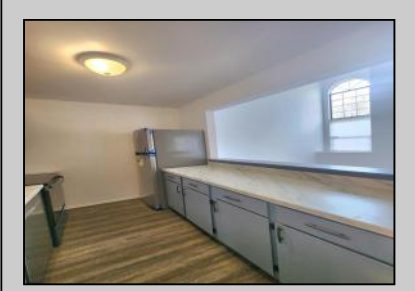
3212 Juniper Mays Landing, NJ 08330