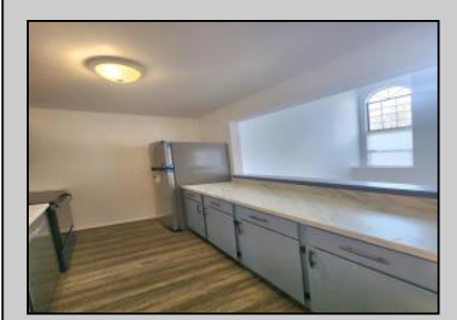
3212 Juniper Mays Landing, NJ 08330