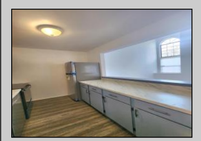
3212 Juniper Mays Landing, NJ 08330