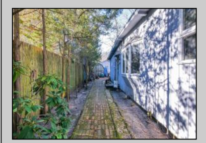
1211 Riverside Mays Landing, NJ 08330