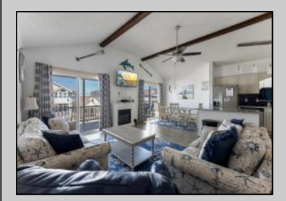
5223 Asbury Ave Ocean City, NJ 08226