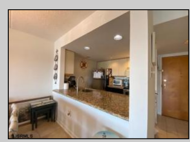
4500 Brigantine Brigantine, NJ 08203