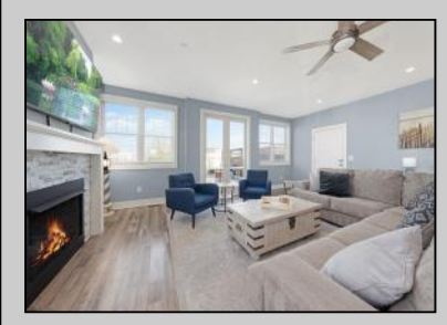
1000 Asbury Ave Ocean City, NJ 08226