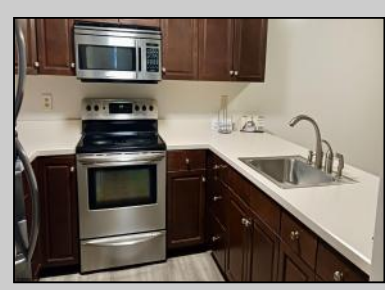
207 Heather Croft Egg Harbor Township, NJ 08234