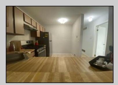
89 Club Pl Galloway Township, NJ 08205