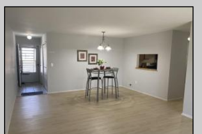
89 Club PI Galloway Township, NJ 08205